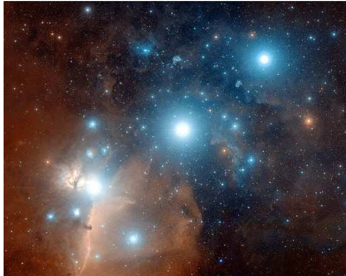
Hubble Image: http://apod.gsfc.nasa.gov/apod/ap051013.html

The Orion Nebula is, in fact, part of a much larger cloud or nebula in the constellation of Orion ( http://en.wikipedia.org/wiki/Orion_Molecular_Cloud_Complex ). We chose the name Orion for our Cloud Pack (apart from the obvious puns) because we believe that Cloud Computing is only a stepping stone towards what we term Molecular Computing , in which many independent platforms and services bond together to form network patterns . These patterned systems act like molecules with new properties, bonded together by promises . This view follows naturally from a description of computing using Promise Theory, replacing traditional monolithic and hierarchical systems with a more natural form of engineering ( https://cfengine.com/inside/deepBackground ).